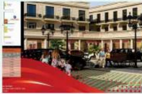
FORTEASIA MART SEC-26/28, ROHTAK