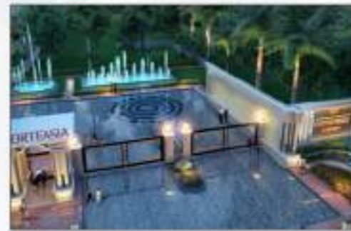
FLOWER VALLEY SEC-26, JIND