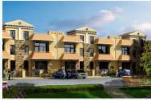
SILICON VALLEY SEC-22D, ROHTAK