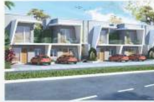
THE GRAND SEC-35, BAHADURGARH