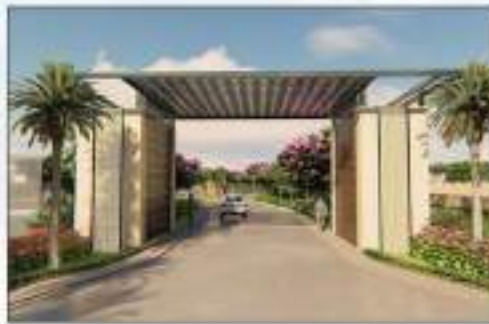
FLOWER VALLEY SEC-25, YAMUNANAGAR