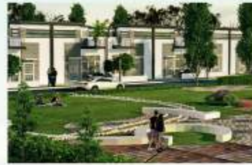
FORTEASIA RESIDENCY SEC-28, BAHADURGARH